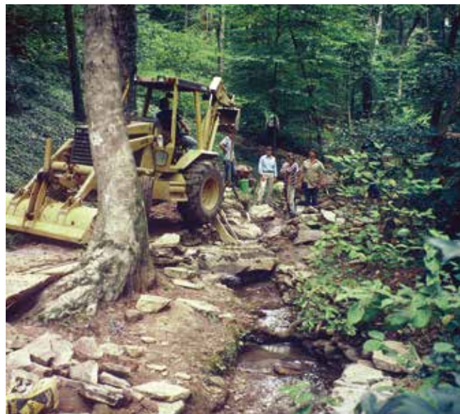
LISTEN TO THE LAND: CREATING A SOUTHERN WOODLAND GARDEN BY LOUISE AGEE WRINKLE (PITH PUBLISHING INC., 2018), $40. FASHION AND VERSAILLES BY LAURENCE BENAIM (FLAMMARION, 2018), $65.

CLOCKWISE FROM TOP LEFT: Wrinkle added native crab apple to her mother's original sunken garden. • St. Fiacre, the patron saint of gardeners • A crisscross pattern of Confederate jasmine graces the parking court. • "To gain a 'natural look' demands men and machines," writes Wrinkle.